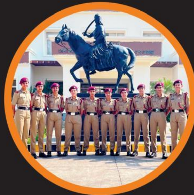
First Batch of NDA Preparatory Wing

"Shubh Karman Te Kabhu Na Taraun" Lady Cadets trained to lead the nation and become Women of Substance